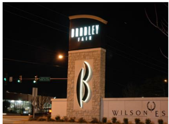
Pylon with creative elements