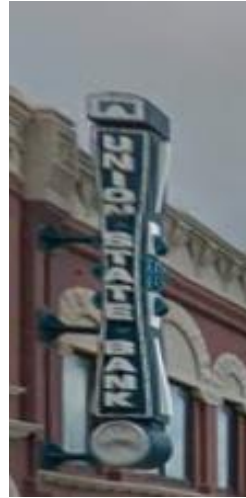
Projecting sign with creative elements