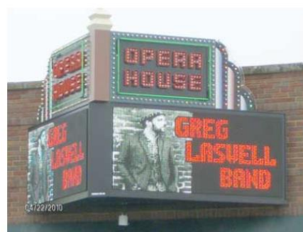
Marquee with creative elements