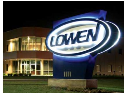
Monument with creative elements