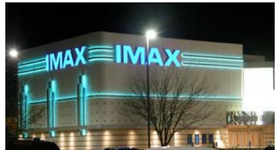
Wall sign with creative elements